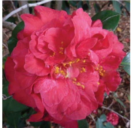
'Blaze of Glory'