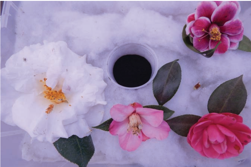
PP dry without grapes

Please note that several flowers have moldy stamens except the flowers without grapes. All the grapes also had “mold”. There appears to be no advantage in using grapes.