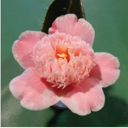
'Baby Sis Blush Var'