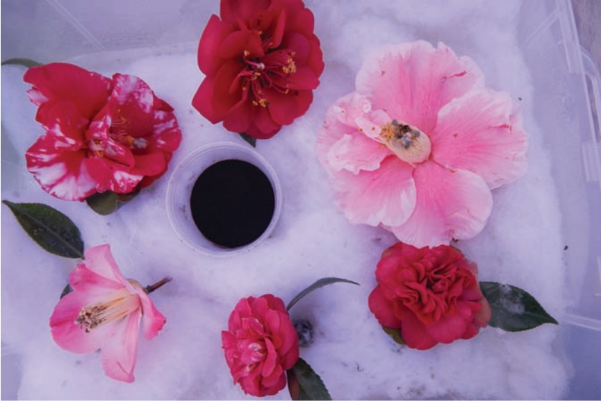
PP dry with grapes