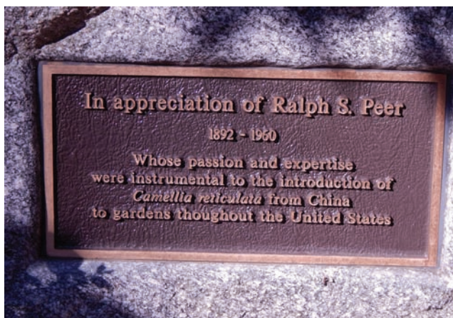
Ralph S. Peer appreciation plaque