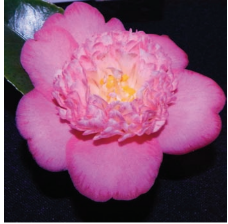
'Baby Sis Pink'