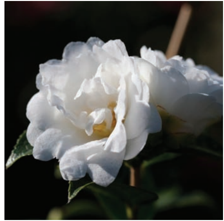
C. grijsii single bloom

C. grijsii was first described in 1879. It is native to China in the mountains near Fujian, Sichuan and Guangxi. It is a potential garden plant due to its fragrant profuse white flowers. The small flat flower blooms midseason on an upright somewhat columnar shrub with small, coarse leaves. The branches are smooth and rust-gray in color when mature. Young shoots are thin and have sparse hair. Scientists have found chromosome numbers of 2n = 30, 60, 75 and 90 in different plants. While this is not an issue for using it as a landscape plant it is a concern for breeding. It is expected that the best results would be obtained between parents with the same number of chromosomes.