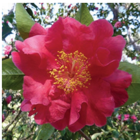
'Dataohong' aka 'Crimson Robe' a Peer introduction in 1948