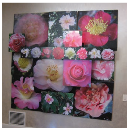
Art in the Boddy House Camellia Room at Descanso

The Southern California Camellia Society 46th annual show at The Huntington is February 10 and 11. The Huntington will have an excellent selection of large camellias for sale.