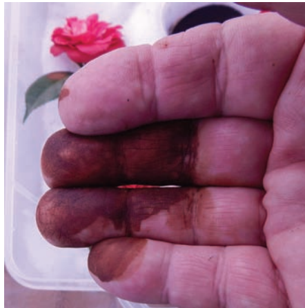
Fingers stained by PP

The use of PP either dry or wet helps reduce appearance of aging in cut flowers with or without a grape placed on the flower stem for two to three weeks. Quality of flowers was variable with some showing mold and brown marks but others still looking good. In conclusion, the use of dry PP was as effective as wet PP. Therefore, it is concluded dry PP is easier and much cleaner to use. If you have a green thumb and wish to avoid the dreaded brown fingers; it is highly recommended to use dry PP to keep cut camellia flowers fresh when stored in a refrigerator in cups containing a flower preservative.