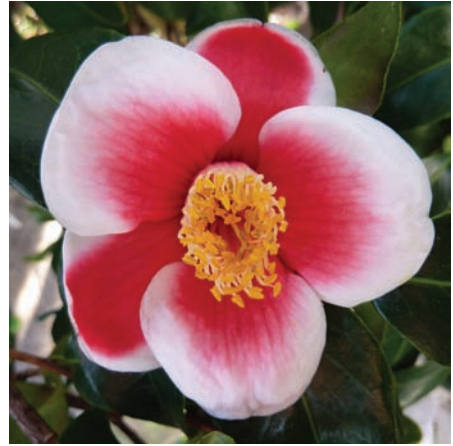
‘Tama no ura’

Some of the seedlings of ‘Tama No Ura’ will inherit differing amounts of the desired white border. Many will have small red flowers. The seedlings that inherit the white border also can pass the trait onto their seedlings. For example, ‘Tama Peacock’ X ‘San Dimas’ has produced a seedling with a white medium cup shaped flower with a burgundy central spot which I call ‘King’s Cup’.