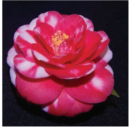
'Little Babe Variegated'