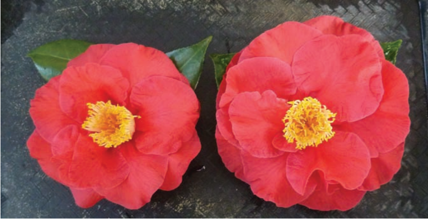
'Grand Prix' Natural and Gibbed