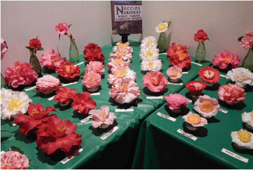
Nuccio's Table at a Descanso Show