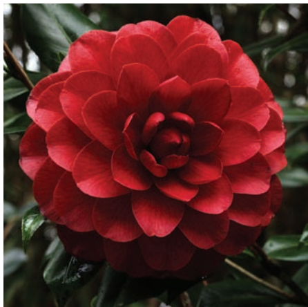
'Tudor Baby'