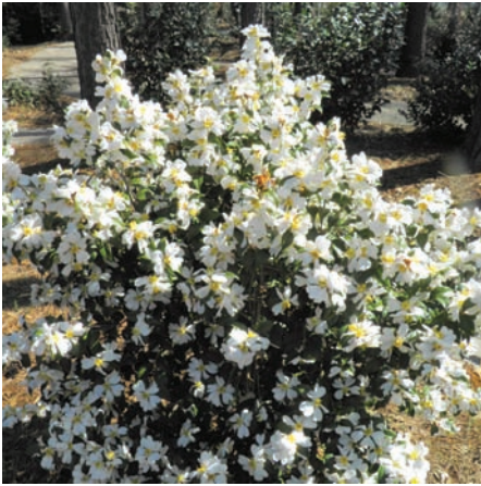
C. grijsii plant