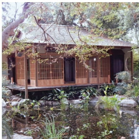
Tea House at Storrier Stearns

The Storrier Stearns Japanese Garden is a little gem located in Pasadena, originally designed in the mid 1930s. This private garden is only open to the public on Thursdays and the fourth Sunday of the month. It is best to get a group ticket and go on a Thursday as parking is limited in this residential area. The garden has recently been refurbished and a small art gallery has been opened this year. The garden is well planted with a variety of traditional Japanese plants including C. japonica cultivars, a lovely pond, fountain and teahouse.