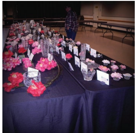
Camellia Show Ayres Hall

The Los Angeles Arboretum has added a wide variety of camellia species to its collection. The plantings are an easy walk from the entrance in an area that is not well traveled by visitors. The Southern California Camellia Society will hold its third camellia show in Ayres Hall on February 21 and 22.