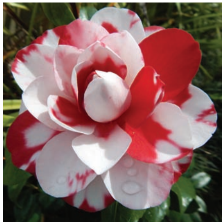
'Tudor Baby Variegated'